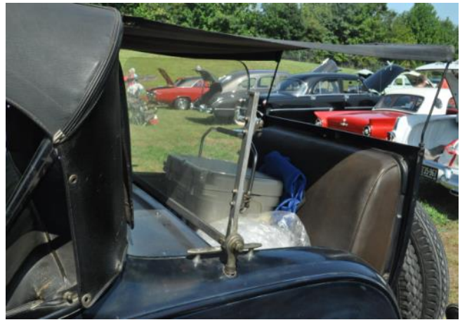
Interesting Rear View