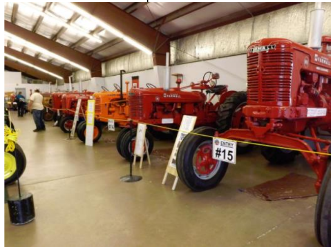
The Restored Tractor Display