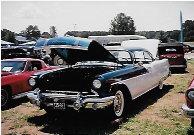
Warren's 1956 Pontiac