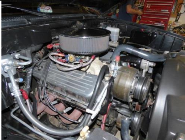
Engine Compartment Before