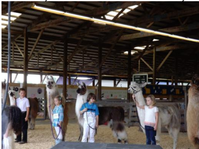
The Llama Show

On Sunday morning, the last day of the fair, they even scheduled an open car show. We got there early to see many of the cars. There were 44 cars by 10:30. Here are few "fair" pictures.