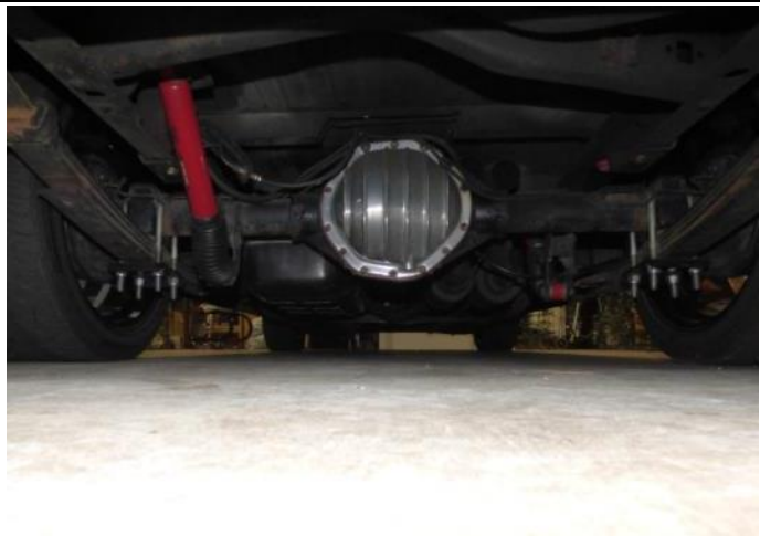
Rear End Cover Before