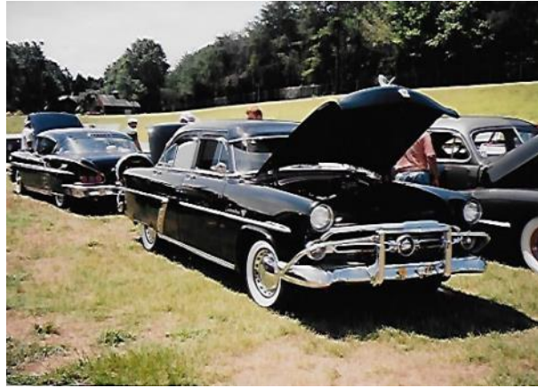
Larry's 1958 Chevrolet Back View)