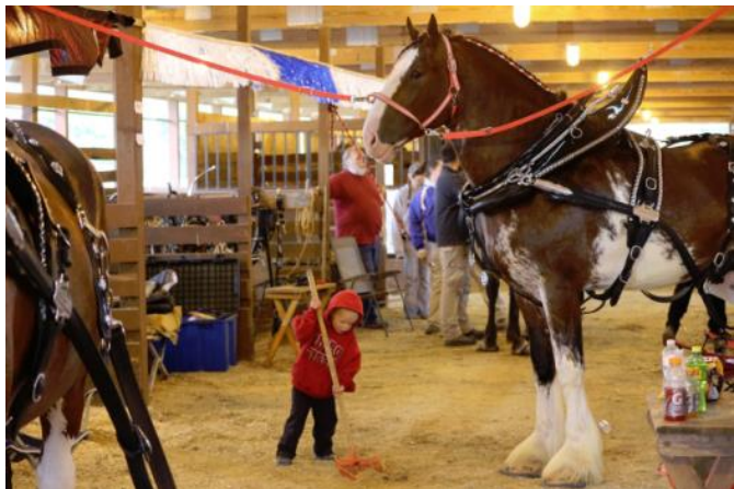
Cleaning Up After One Horsepower