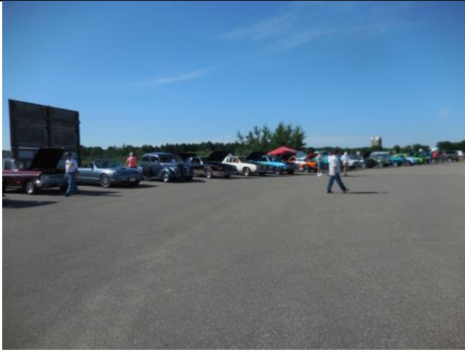
The Show Field