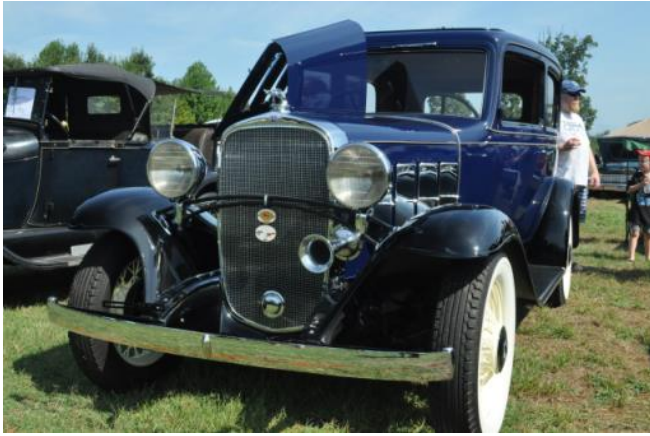
Warren's 1932 Chevrolet