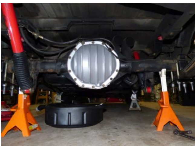
Rear End Cover After