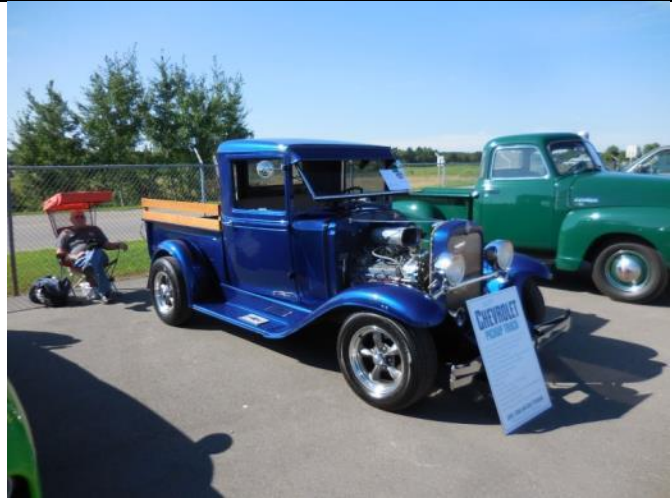
Modified and Original Trucks