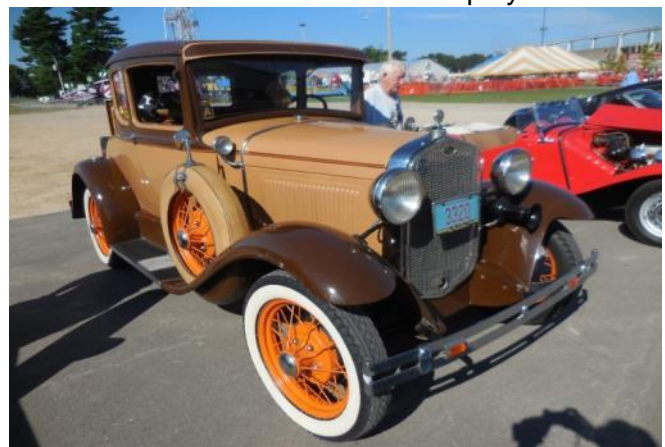
A Few More Horsepower