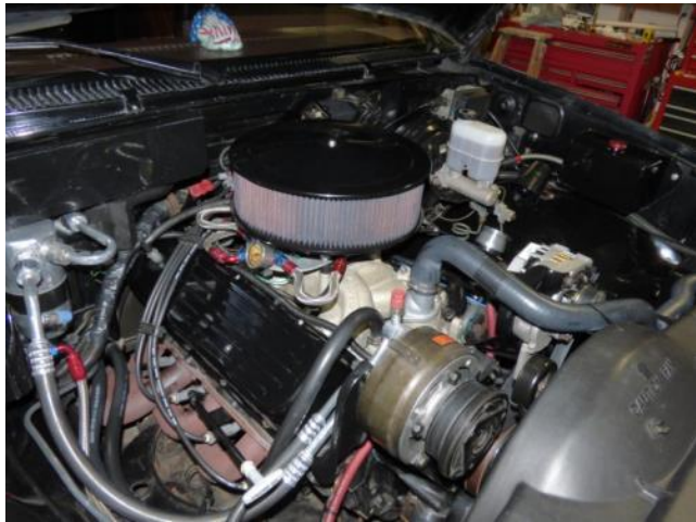
Engine Compartment After