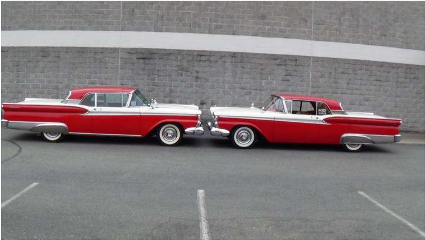
Seeing Double? – Which one is Jack's?