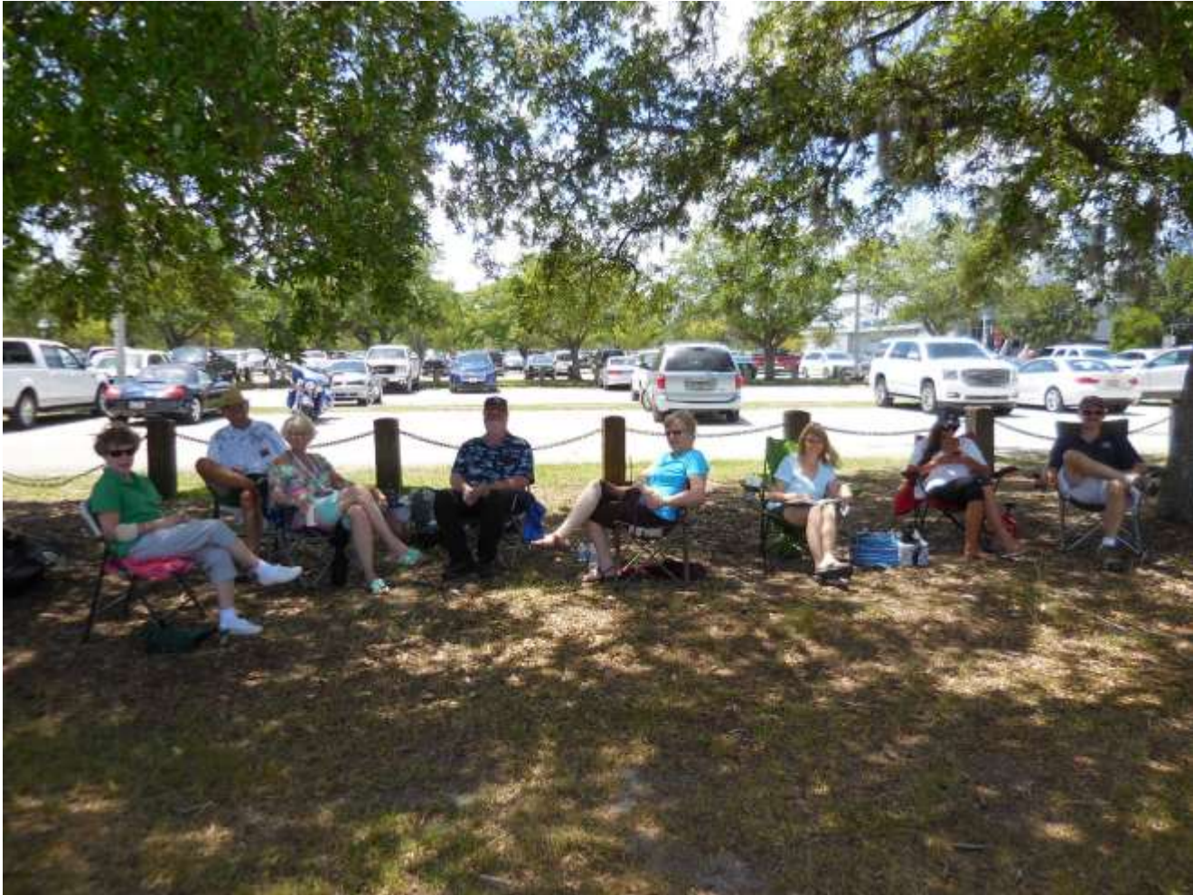
The Triangle Group in Wilmington