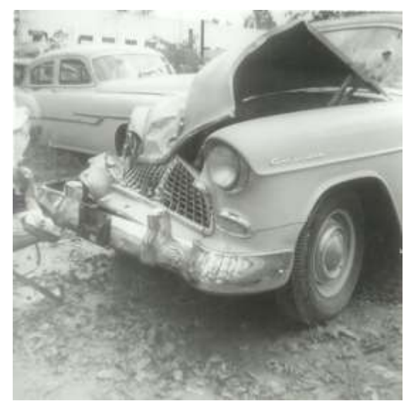
Bob's Wrecked 55 Chevy

first car. He went to a local Chevrolet dealer in New Jersey and negotiated a deal for a new Chevrolet 210 Two Door model. The two tone sedan was colored blue on top and light blue on the bottom. It was a six cylinder car with a standard transmission, no radio. The red car shown is the actual picture from the original 1955 dealer brochure of all the 1955 models that Bob saved. The writing in the upper right hand corner in the dealer's handwriting is the price for the car, $1800.