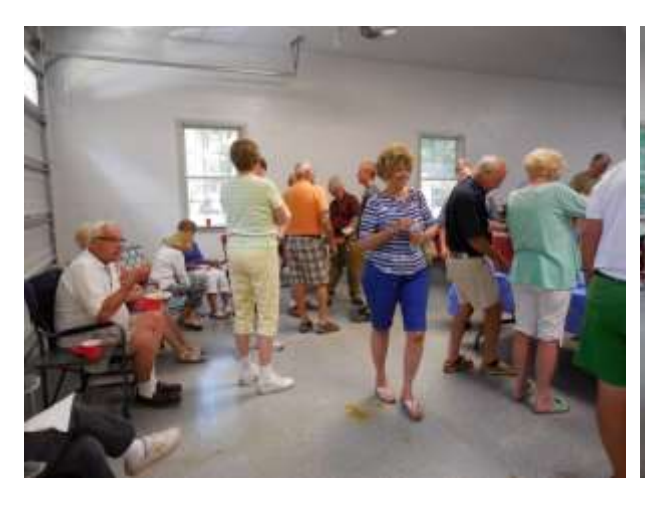
Members Enjoying Ice Cream