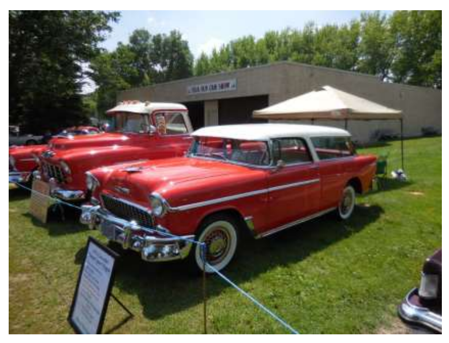
Three Tri Five Chevys, One Owner

Every year in the second week of July, enthusiasts in the Midwest look forward to the big lola Car Show and Flea market in Iola, WI. This years' event was held on July 9-The event is 11, 2015. organized by the Old Cars Weekly staff and local service clubs in this city of of.1200. They have changed the event to Thursday Friday and Saturday because they determined that most vendors and buyers leave Saturday afternoon. This years' show set a record for attendance.