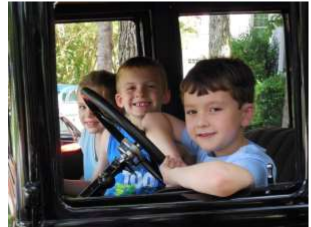
Riding in Grandpa's Model T