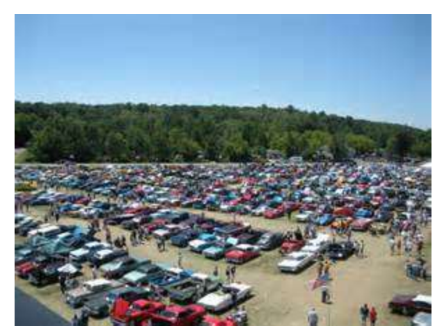
The Show Feild

lola for display. They enjoy going to various events to display the car and answering questions. This original manufactured car was impressive to see. It reminds you that some modern restorations may be over-restored.