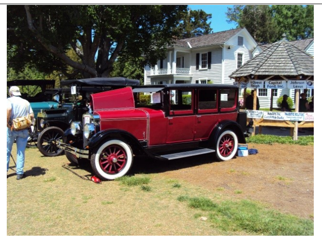
Scenes from the 2014 Triangle Chapter Car Show