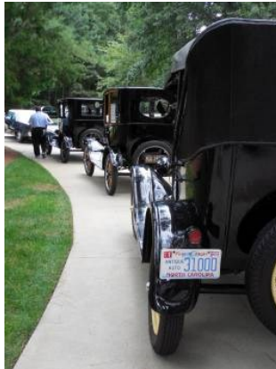
Three of four model Ts displayed on the driveway.....ready for judging?