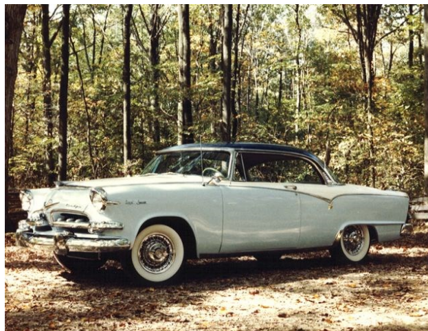
Mike's L'il Darlin' looking pretty

Back in my garage I compounded out the sides of the car and waxed it. I went to bed around 3 AM, got up a few hours later, worked a full day, and then drove 550 miles to the meet. A magazine photographer at the meet took pictures of my car and they were published in a magazine.