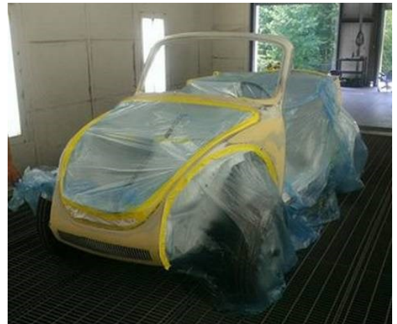
A Stewball successor? A friend of the editor is getting her bug ready to roll. Membership forms will be sent.)