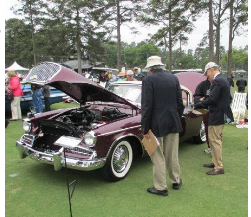
Judging the Hawk at the 2013 Pinehurst Concours.