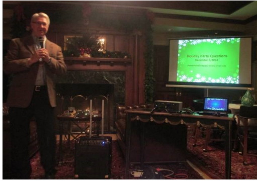
Our fearless leader puts on a great show and trivia game.

The Trivia Game was lively! There were many steals for the candy, cookies, peanuts, pecans, etc. The best was what happened at the end. There were no more gifts on the table and the dreaded Pink Elephant just sat on the floor.