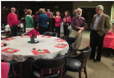
The crowd gathers for conversation and fun

A great time was had by all at our annual Christmas party. Almost 50 people attended our event in early December. I was "chosen" to host the event this year and come up with some changes and I believe the changes were well received.