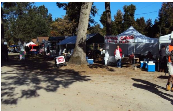
Food and booths are part of the fun at The Eders.