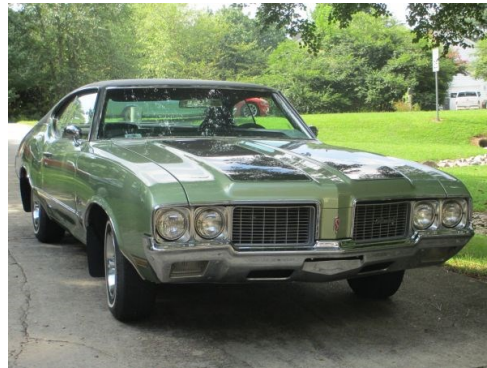
Mo' muscle. Larry Wright's 1970 Cutlass