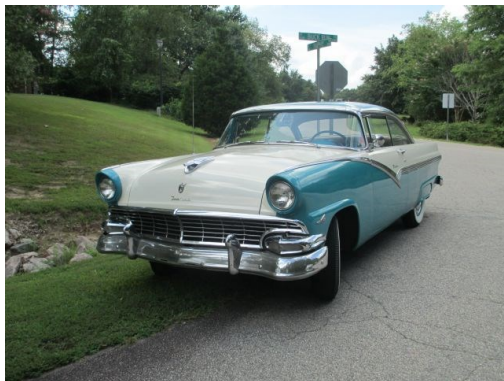
Pretty 50s mystery car "Victoria".