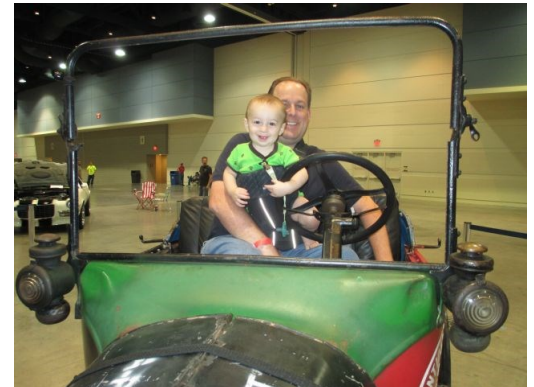
Start them off right! This 9 month old could not wait to drive the T and smile for the camera.