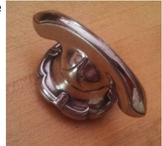
A pretty windshield crank handle creates some mischief.

indicated normal and there were no unusual noises. My first thought was that the throttle rod was disconnected. Still, when I pressed on the pedal, I could hear the air inlet noise change so it was obviously OK. It felt like we were out of fuel but the fuel pressure gage was fine. I turned the electric pump on just in case – no change. We finally coasted to a stop and the groom was ready to jump out and give a push but we were safely off the main road by then.