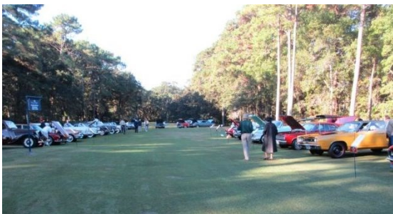
The Show Field at Hilton Head

The Concours organizers maintained the same format for the 2013 event as in previous years. There was a driving tour of locations on the island on Friday, a show for cars from local clubs on Saturday and the Concours itself on Sunday. As in previous years events were well organized with many