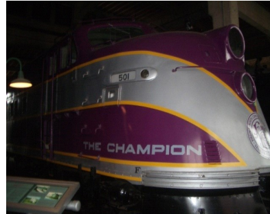
The Champion Diesel Train Engine.

Thanks to the Triangle members for making the display and demonstrations successful .