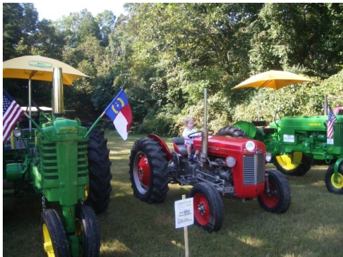
Tractor Display at Oak View

The tractor club also brought several tractors to the event. Their signs say stay off, but it is impossible to keep kids off tractors.