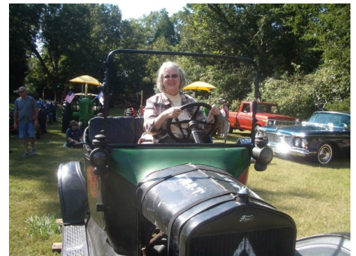
Driver in Training!

Pictures of children (young and older) in the Take-A-Part T after the demonstrations was again popular. A light barbeque lunch was provided to participants by the Park.