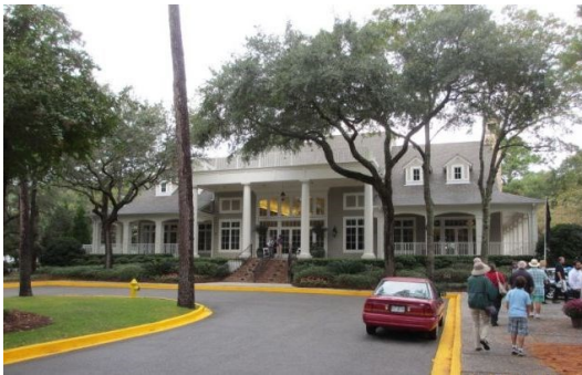
The Clubhouse at Robber's Row

Single family homes started to be built in 1959. The inn, clubhouse and the first 9 holes of the golf course came in 1964. The course is built on Civil War grounds and features historical markers at each tee. Financial up-and-downs have caused bankruptcies and mergers, but with the rise of the homeowner association, the area is thriving today.