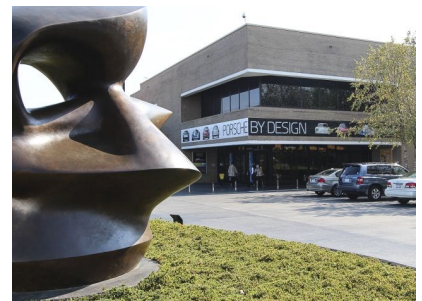
Porsche by Design exhibit at NCMA in Raleigh.