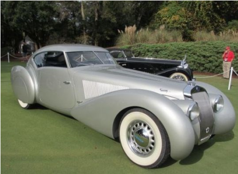
first, pictured left, was a 1937 Delage D8-120 Aerodynamic Coupe .

A special exhibit of the collection of Sam and Emily Mann brought several Pebble Beach winners and vehicles most of us have only seen in pictures. The