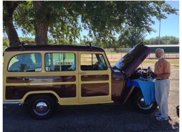
Is that Dan Fuccella on the big trek with the Willys or Santa and a classic sleigh?