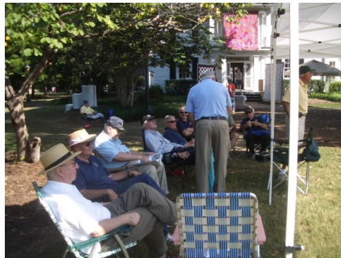
Enjoying the Shade and Music