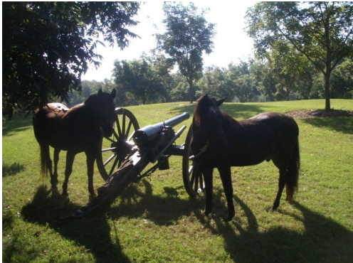
Civil War Cannons with Horses

Our chapter was invited to display our cars