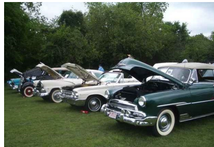
Post war production cars waiting to be judged.

Two Take-A-Part T assembly demonstrations were completed for the crowd. The times were good for both shows, 6:15 and 7:12 minutes respectively. Several members participated in the demonstration as first time assemblers. Their training was successful as all the parts were put on the Take-A-Part T, it started, and drove away successfully both times.