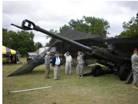
Soldiers sharing their expertise with tour participants.

Soldiers shared their equipment and stories and mused over our cars as they voted for who would win the "Soldier's Choice" award to be given out on Sunday.