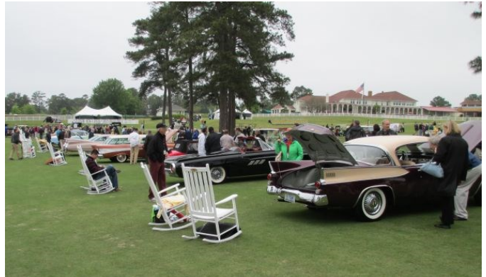
Rockers lined up behind cars in the Post War Production class. Joe Parsons' Studebaker Goldenhawk is on the right.

The concours honored the history of Pinehurst and the resort in many ways. Each entrant had two specially made white rockers available to sit in during the day and available for purchase after the event (all proceeds going to three local charities).