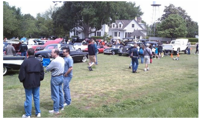
Crowds and cars at Oakview