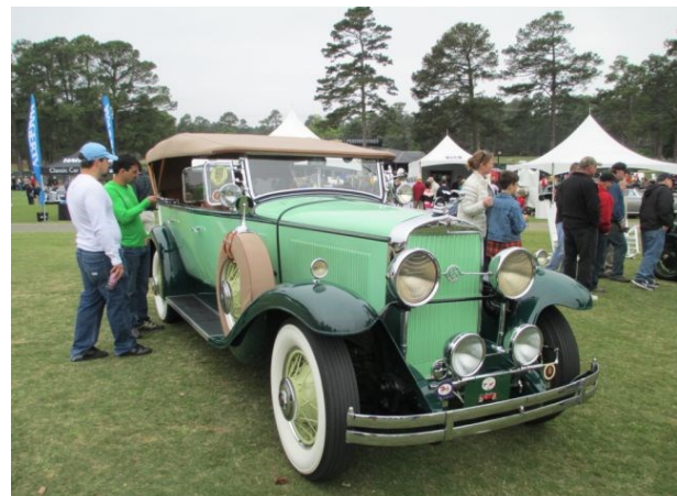
"Sally", Tommy Fitzgerald's LaSalle looking pretty.