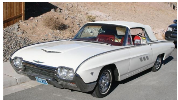
Marshall Spader's 1963 Ford Thunderbird turns 50!