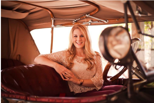
Left: a shot from inside a 1916 Buick. Below: Fall colors and a 1929 Buick.

Apparently students are not required to use school endorsed studios anymore. They are free to use whatever they like for scenes. It was a beautiful fall day so we took three of the cars out on the driveway and she did various shots in and around the old cars.