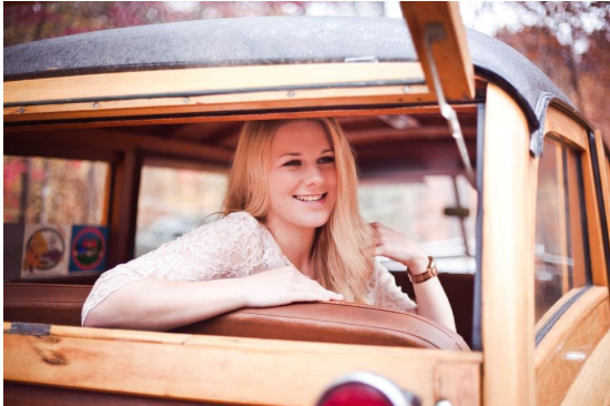
A new angle on the 1947 Pontiac. All smiles.