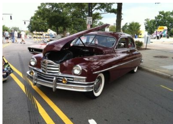
Paul Teet's Packard keeps the crowds entertained outside the convention center.