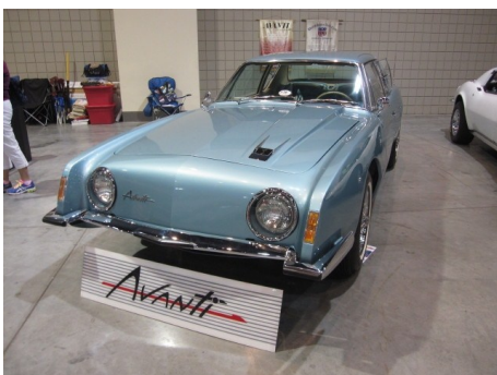
Joe Parson's newly restored 1963 R-2 4 Speed Avanti. Looking perfect.

For an incredible slide show of the cars there, visit: http://www.flickr.com/photos/38575849@N02/sets/72157631238918168/show/