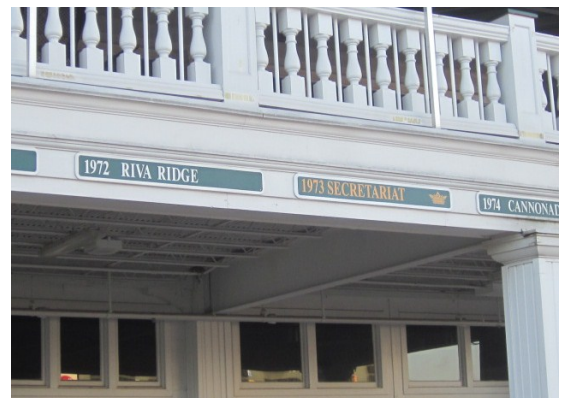
Remembering four legged champions from an earlier time. Kentucky Derby winners Riva Ridge and Secretariat (Triple Crown winner).

Organizers from the first ever Pinehurst Concours D'Elegance will share their vision and plans for the inaugural event which will take place in May 2013. They will talk about their unique partnership with Fort Bragg, the charities they will sponsor, the Friday tour, special events and more. Come see and hear all the exciting news!