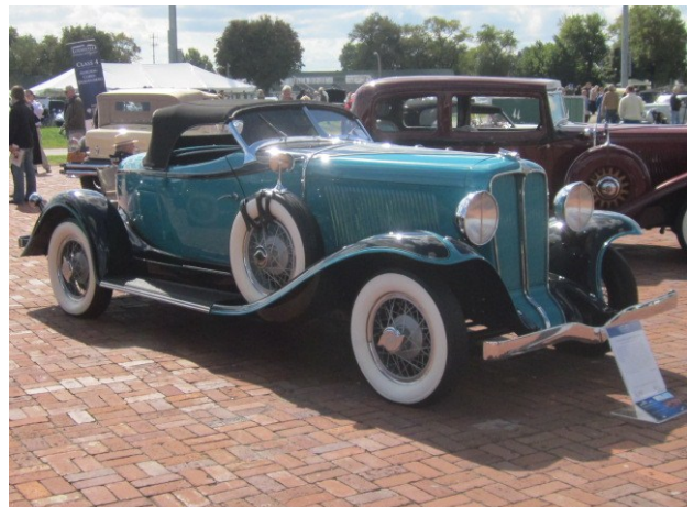
Right: A 1932 8-100 Auburn Speed- ster