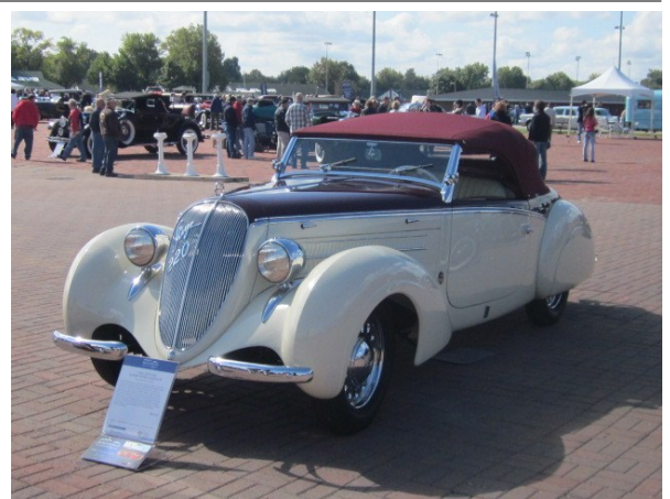
Right: 1938 Steyr Glaser Roadster.