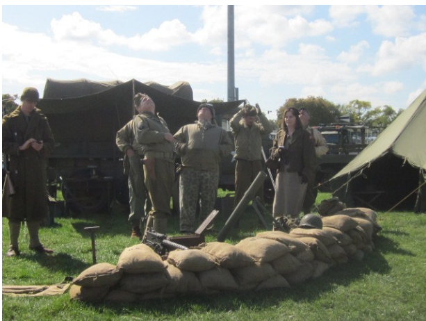
Left: A World War II military display.