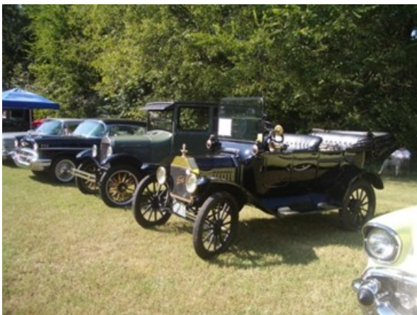
Triangle Chapter Cars on Display