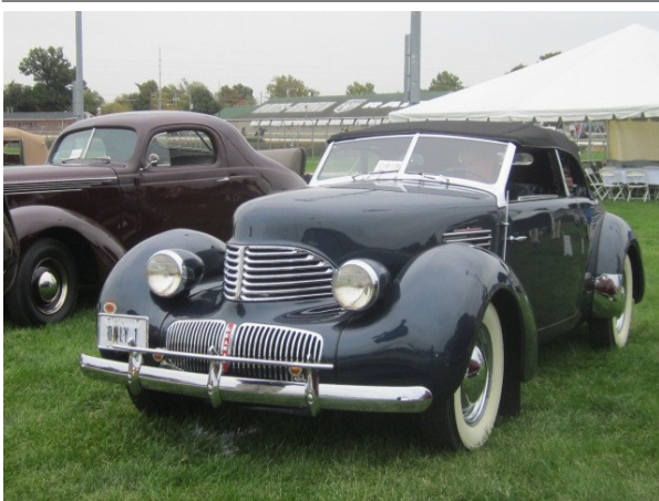
Left: 1940 Graham Hollywood Convertible