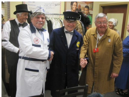
Even the guys strutted their stuff.