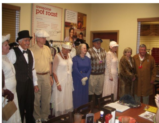
Everyone looking great!