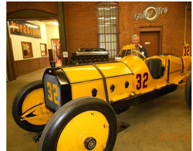
1911 Marmon Wasp replica