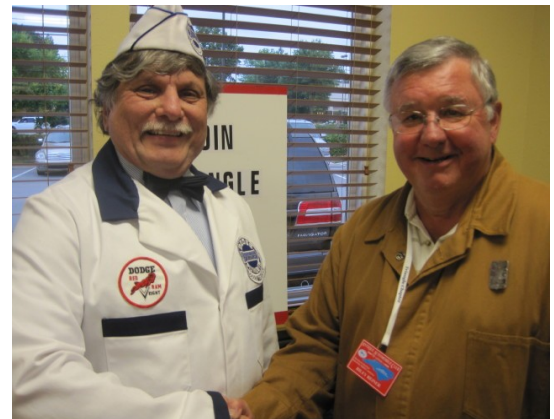
Dodge and Ford getting along at the May meeting. Fashion works wonders:)