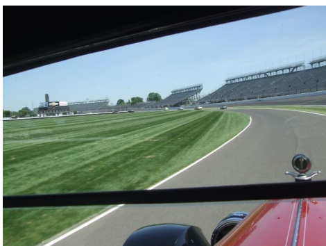
"Dolly" on the track at Indy. Smooth sailing all the way around.