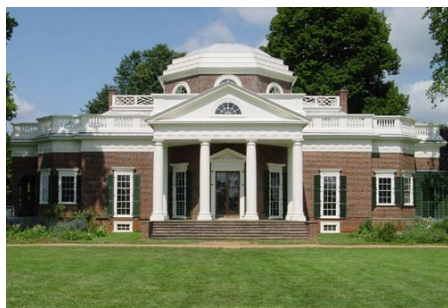
Thomas Jefferson's Home Monticello

On Monday morning, all of us congregated at the host hotel for breakfast and a driver's meeting. Five full days of touring, coffee breaks, lunch in interesting locations and lots of fascinating tour stops made for a very busy week.