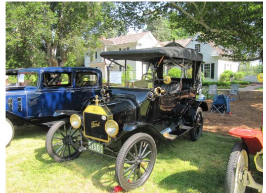
'25 Model T