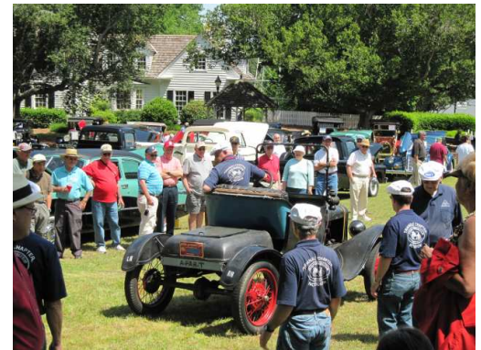
2011 Take-Apart T Team