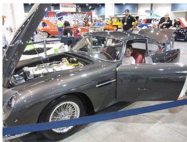
Aston Martin two million dollar plus car $$$$$$$

It's an exciting experience with live bands playing on stage on Fayetteville Street and inside convention center vendors selling parts, memorabilia and car products . There was a restoration business from Pinehurst that brought exotic cars such as (2) Mercedes 300 SL roadsters, Aston Martin, Lola race car, various Mercedes sedans and convertibles, Ferrari, and Jaguars plus others. The Army even had a Vietnam helicopter displayed as well as the TV series Munster's cars were crowd pleasers.