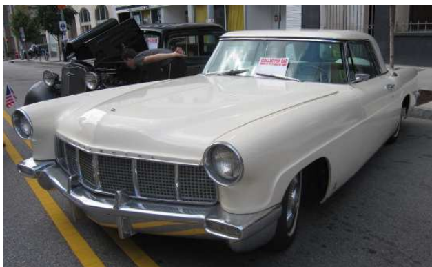
Phil Gervetz's 1956 Lincoln Continental