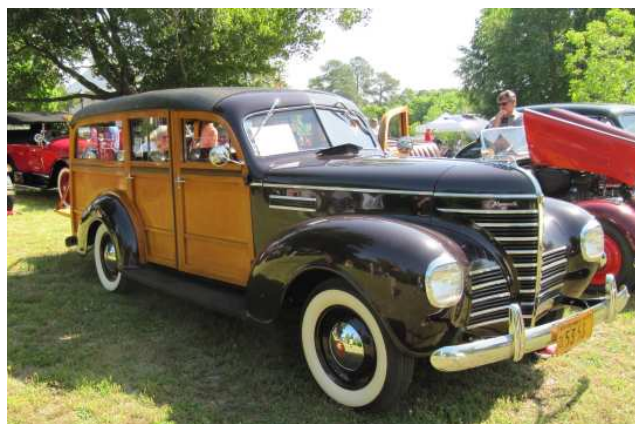
'39 Plymouth - Leo Galvin