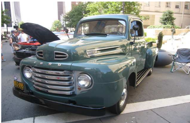
Paul Teeter's 1950 Ford Pickup