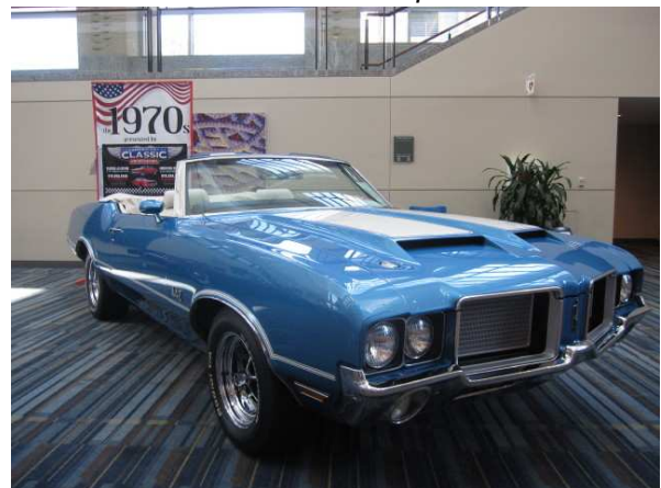
Don Winstead's 1972 Oldsmobile 442 AWARDED THE SWEET 16 AND BEST GM