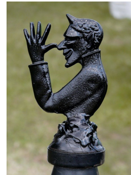
For those that missed Percy Flowers – an amusing hood ornament.