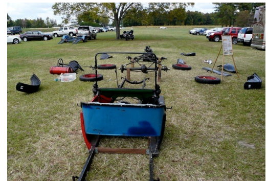
The Take-A-Part T or The Editor's 2001 Volvo?