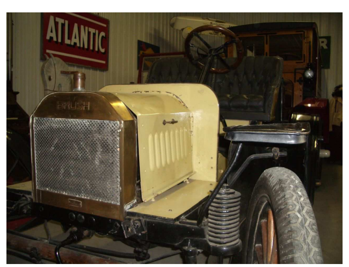
ings. Among the tractors and trucks were a few antique cars. Besides the Stanley Steamer there were also an early "10 Brush and '33 Buick in the collection.

and trucks. He does not appear to have a favorite with all makes and models of gas, diesel and steam tractors displayed. There are a reported over 600 tractors on display The tractors are displayed in several large build-