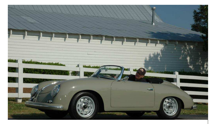
'59 Porsche - Tom Roos