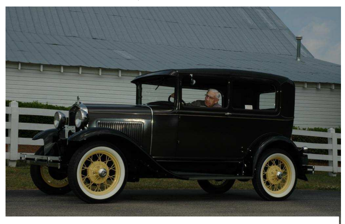
'31 Model A - Leo Galvin