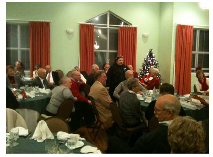
or chicken with vegetables, baked potato and salad. For

The buffet dinner was excellent with a choice of beef