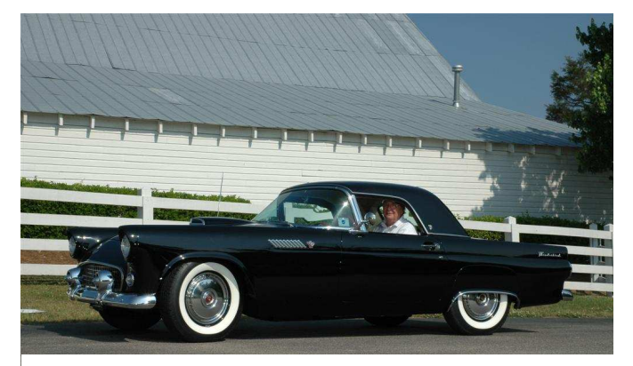
'55 Thunderbird - Fred Harrell