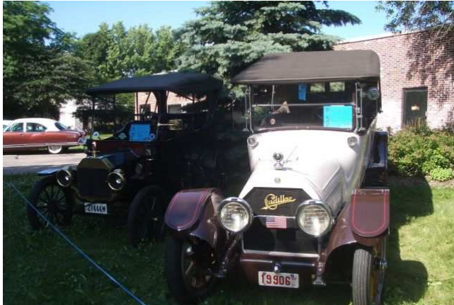
Cadillac and Model T

Each year Iola has theme cars displayed under a special large tent. This years display theme were 50 cars from the 1960s. In the picture is a 1960 Chevrolet hardtop with an Avanti in the foreground.