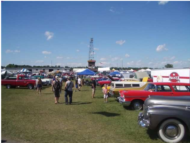
Old Car Parking, with landmark Fire Tower

Every year in July the car enthusiasts from the Midwest meet on a very big farm in Iola, Wisconsin for the biggest car show and swap meet in several states. This is an event that every car enthusiast should see at least once in their lifetime. Since I have relatives in Wisconsin, I try to make the trip every year. I slipped away for a Friday at Iola. It's a 100 mile drive from West Central Wisconsin to the small town of Iola, Pop 1200. The Iola show is sponsored by Old Cars Weekly . They publish many of the hobby publications including Old Car Price guide .