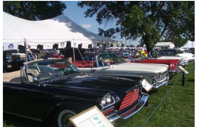
50s and 60s Mopar Convertibles

large iced tea drink. As I turned out of the drive-thru, the drink spilled onto the passenger seat and drowned my passenger, Jill, the GPS voice. Her last words were, "Lost satellite".