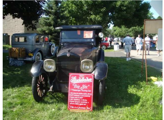
'31 Studebaker Tour Car

This is a large and rare car without much information.