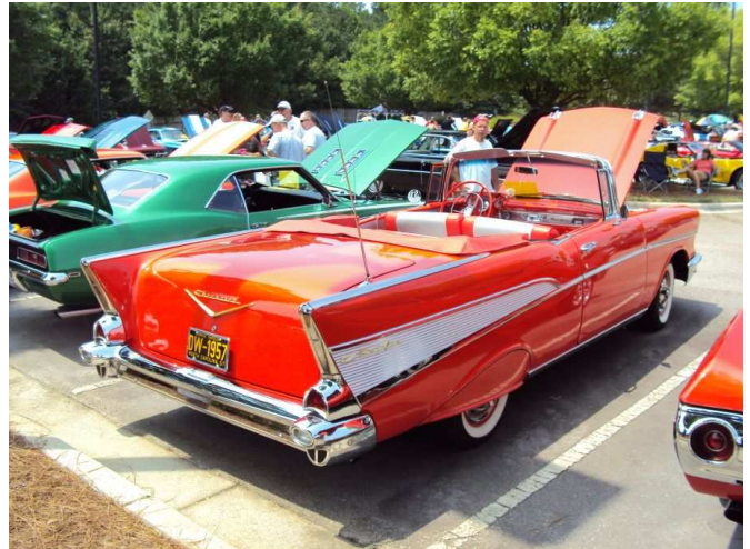
'57 Chevy Red Convertible

The format of the show included $5 Registration from 8 am to 11 am. Judging from 11 to 12, free hot dogs, chips, lemonade and ice cream bars. The trophies were handed out at 2 pm with all activities over by 2:30.