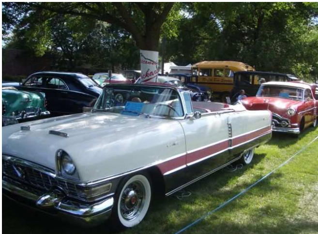
2 Packards and a School Bus

There were two '50s Packard convertibles. The school bus on display in the background was the subject of a special article in the July 29 Old Cars Weekly .