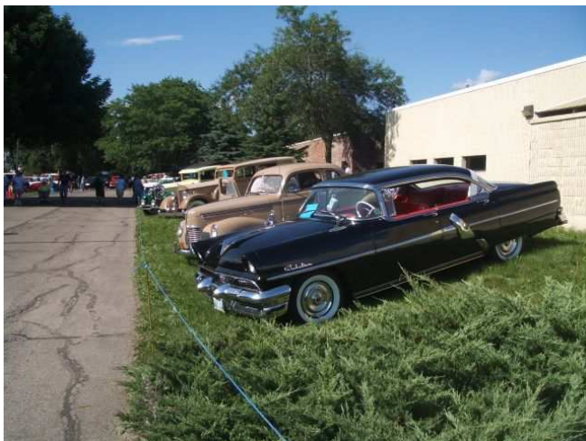
'56 Mercury Richeleau

The main Old Cars office building is located on the grounds surrounded by many trees on a large grassy lawn making ideal display areas for 200-300 Blue ribbon antique vehicles. Here are some pictures of these vehicles. These vehicles included an early Cadillac and a Model T. There was a '56 Canadian Mercury Richeleau. There was also a '31 Studebaker 7 Passenger Touring car.