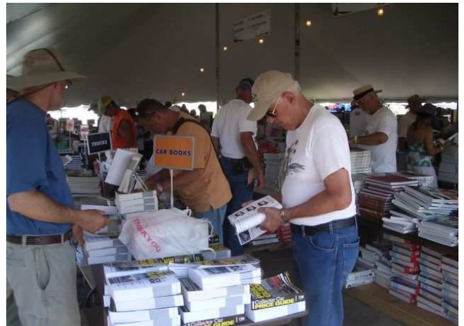
Book Sales Tent with Bargain Books

I took many pictures to help tell my story and better explain what I saw this year. Many of my pictures are also topics in the last two Old Cars Weekly magazines. The first picture is the special parking for antique cars driven to the event. It gives close parking to hobbyists who pay for parking. This area is a car show itself.