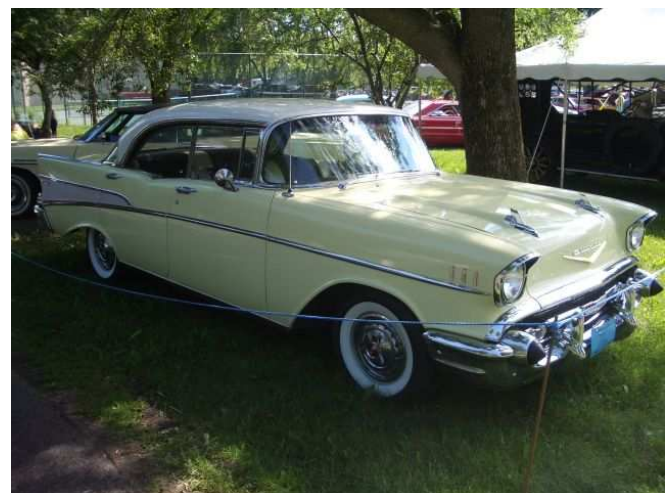
57 Chevy 4 Door Hardtop