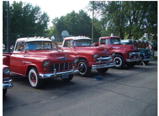
50s Service Trucks