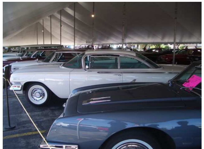
60s Cars Theme Tent

Nearby is the Old Cars Weekly books sale tent. They sell their over stocked books and collector manuals at bargain prices. Small books are a dollar, larger paperbacks are $5 and Hardcover books are $10. I bought two books for my cart, a 2010 Old Car Price Guide and the History of Jeep for Dan and Jean, for $5 each.