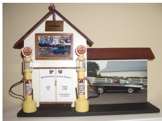
2009 1st Place Trophy